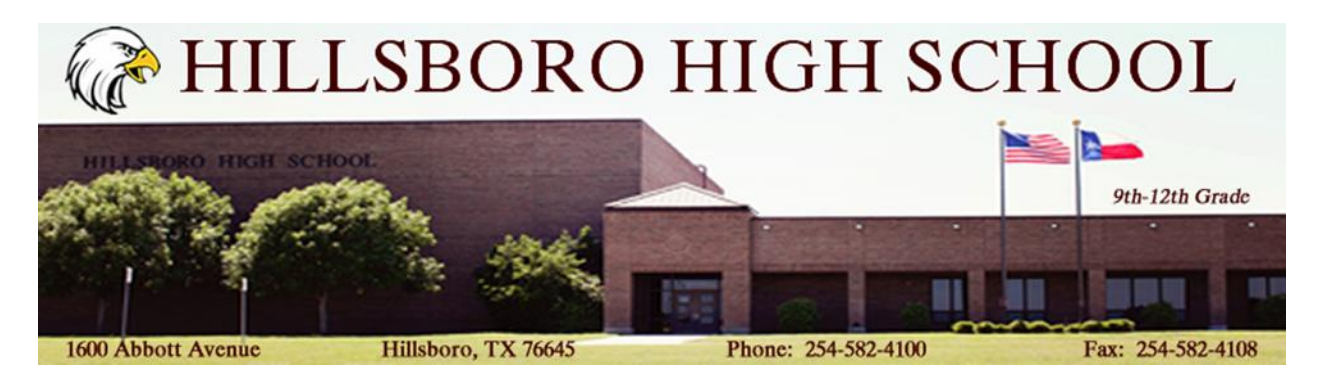
Hillsboro High School Board Report - March 2018