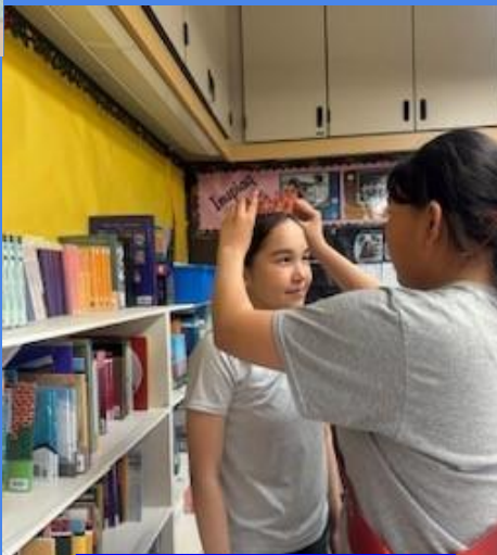
It's Your Birthday