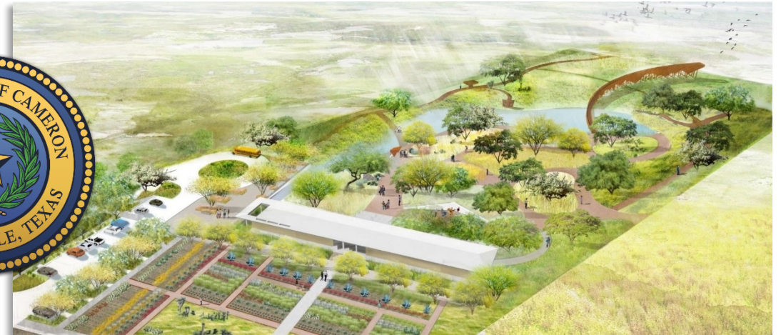
South Texas Eco-Tourism Center / Laguna Vista