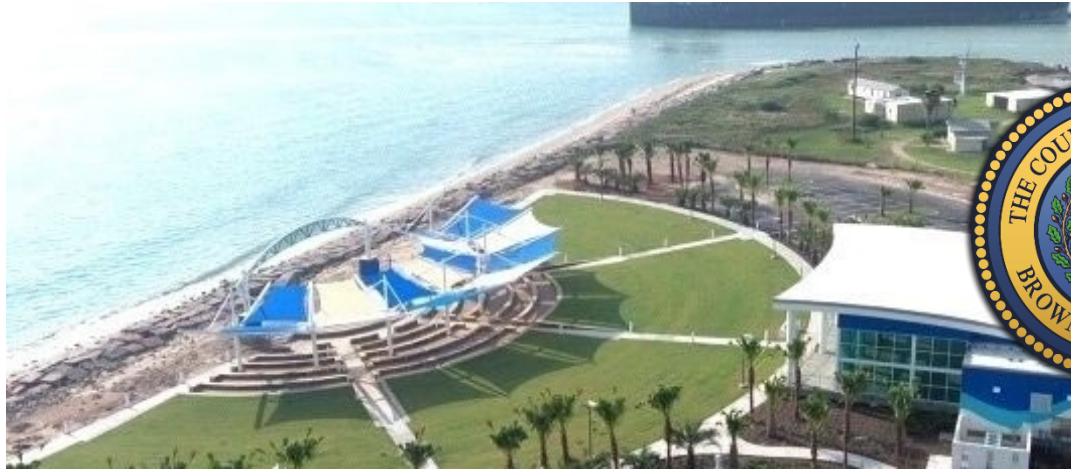
Amphitheater & Event Center / South Padre Island