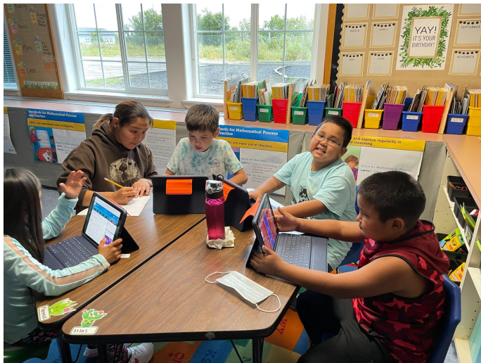
Small group of students working with an aide.