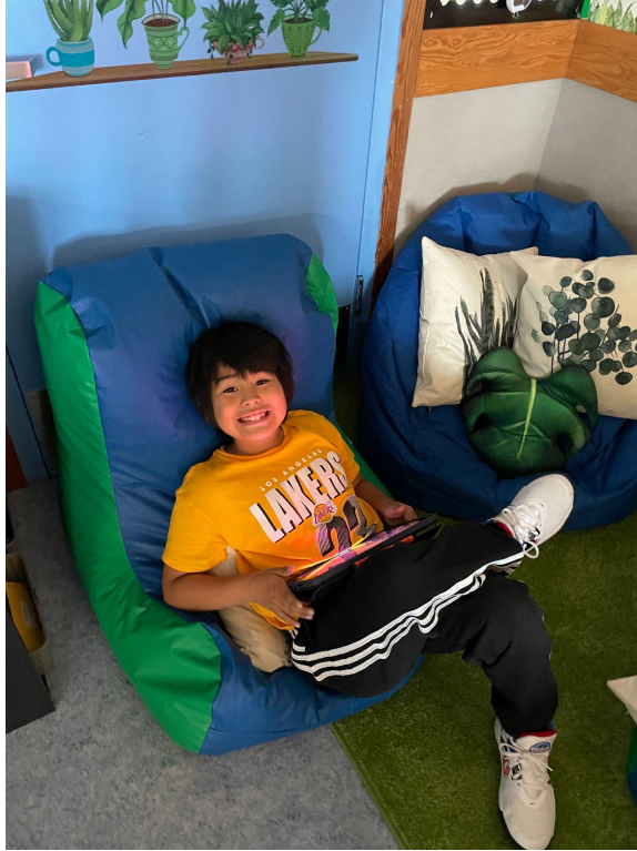
We are loving our new library furniture.