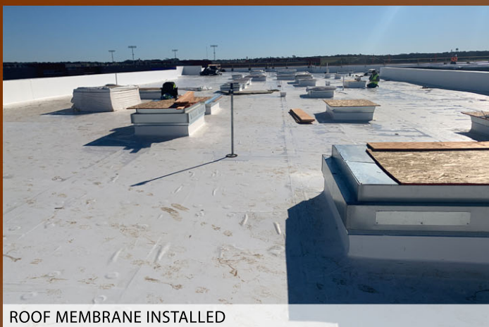
ROOF MEMBRANE INSTALLED