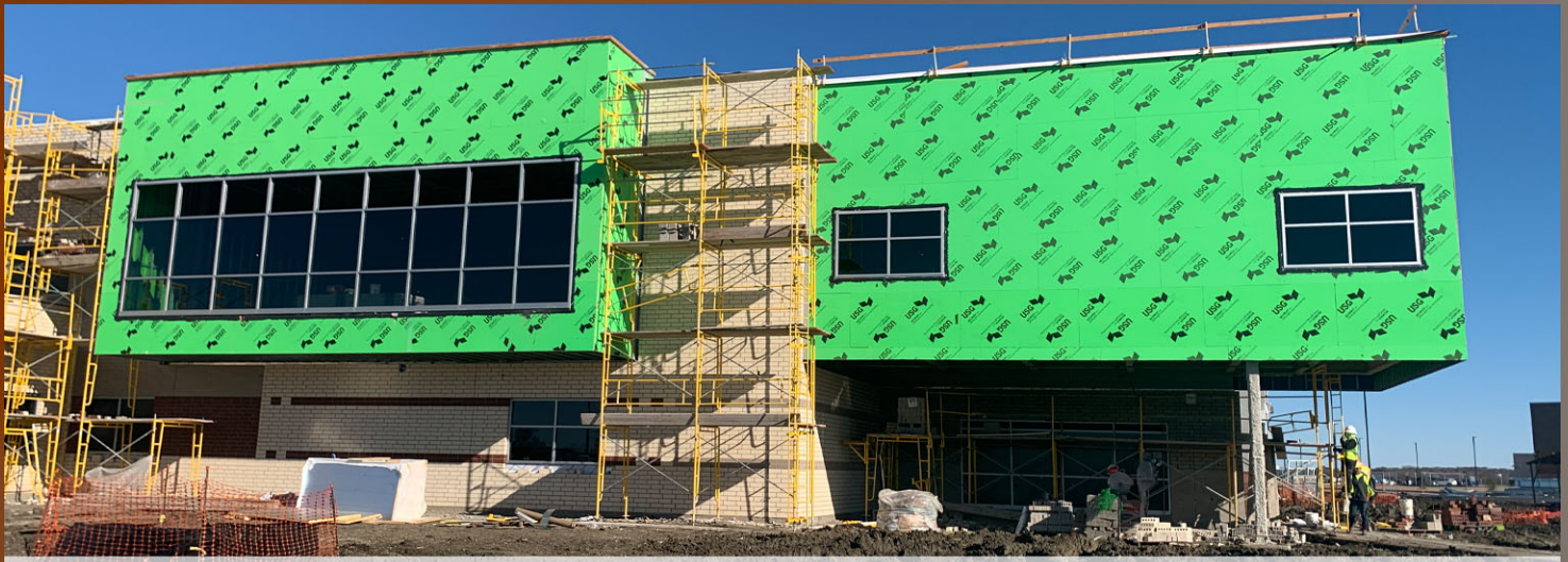
EXTERIOR SHEATHING & MASONRY INSTALLATION