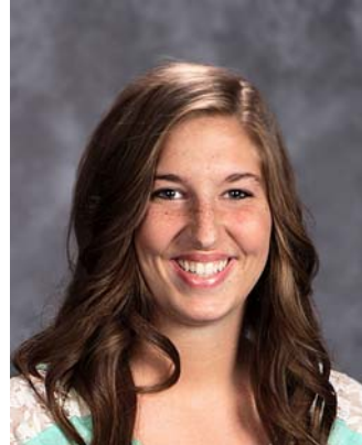
Rotary Student of the Year