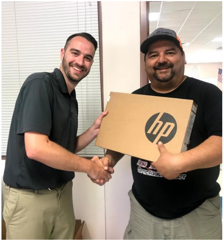
Parents receiving for Students**