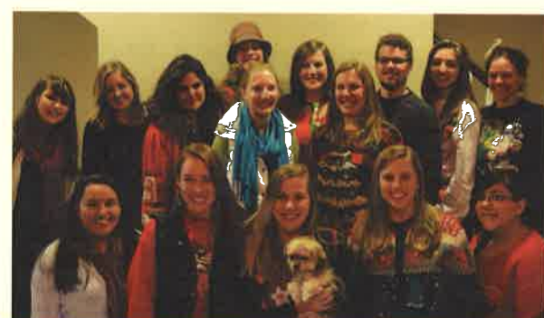
The AmeriCorps and VISTA members of the Portland team wish you a wonderful 2015!

As our students are working hard to create a brighter future for themselves and their families, I want to thank you for providing your hope and support, and giving them the opportunity to succeed.