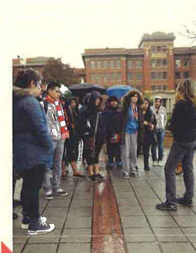
Rain or shine, College Possible students are eager to learn about the OSU campus.