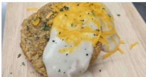
Country Fried Chicken