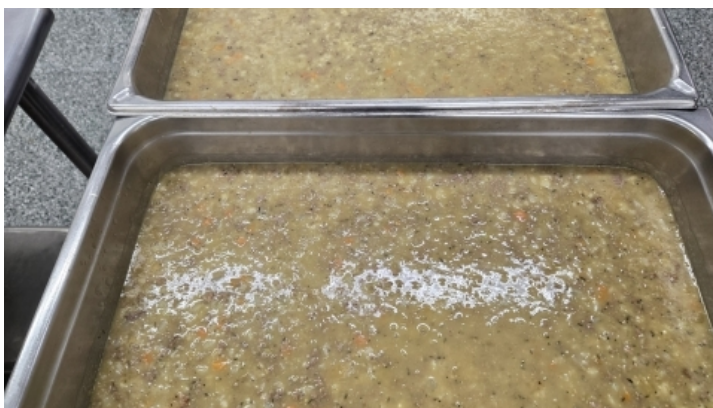
Scotch Broth Global Bites Scotland