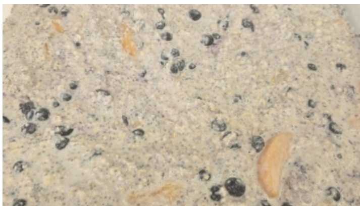
Blueberry Peach Overnight Oats