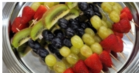
Birthday Fruit Skewers