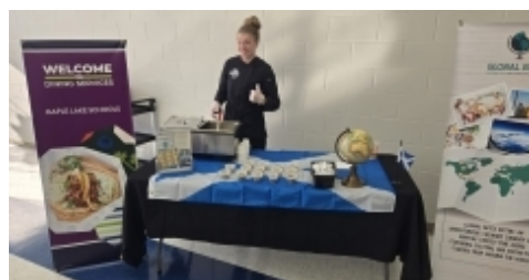
Global Bites Scotland