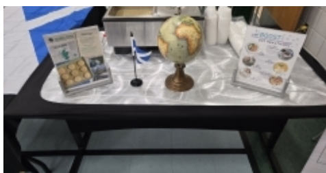
Global Bites Scotland