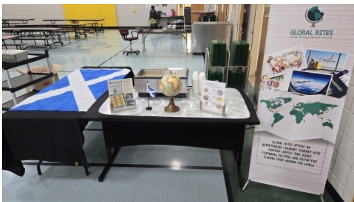
Global Bites Scotland