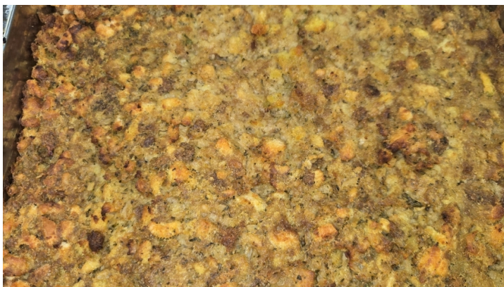
Oven Baked Dressing