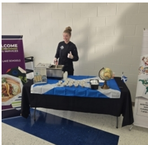
Global Bites Scotland