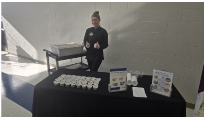
Be Well Blueberry Peach Overnight Oats