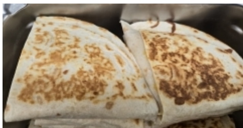
TikTok Chicken and Cheese Quesadillas