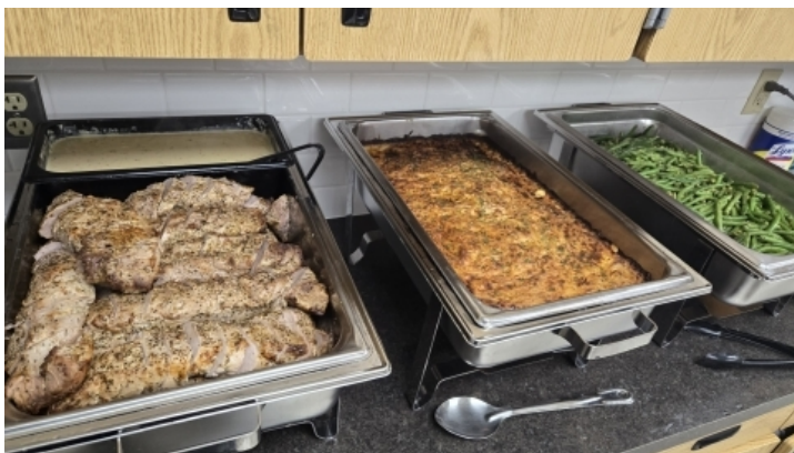
Elementary School Conference Catering