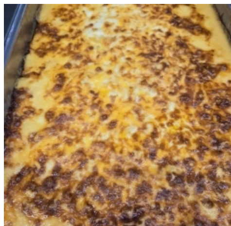
Baked Mac and Cheese