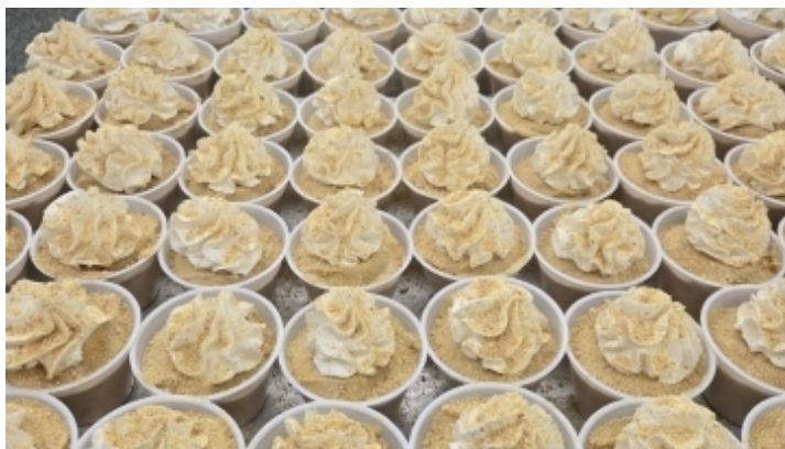
Pumpkin Pudding Parfait