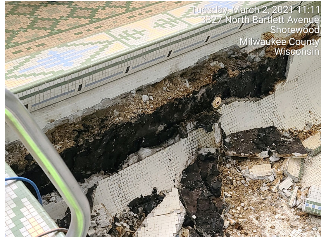
Pool Renovations have begun