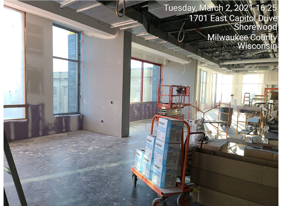
View from inside new addition on the 2 nd floor