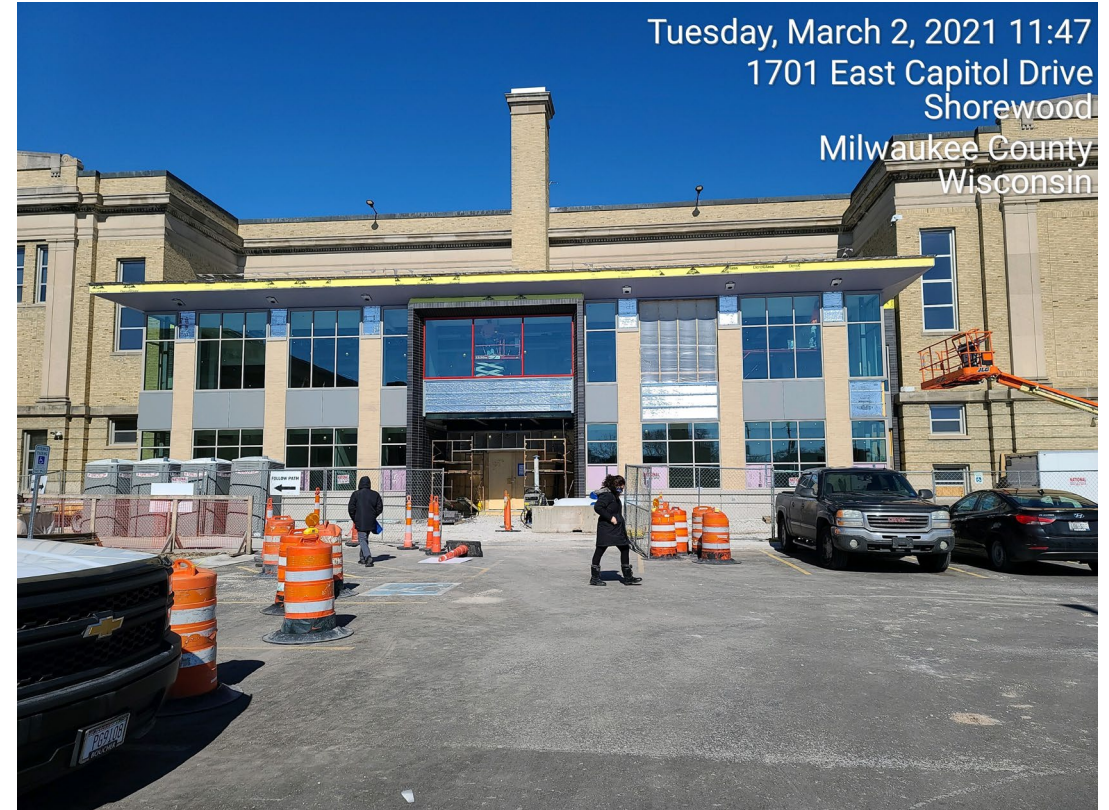
Windows have been installed at the new admin addition and sunlight is brightening up the new admin/LMC addition