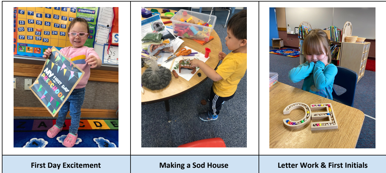
First Day Excitement

It was so hard to select just a few from all the wonderful images I have received. So far, the beginning of this school year has been filled with engaging cultural projects, hands-on learning, and early academics. While it may look a little different, we're still learning through meaningful and play-based interactions. These images capture the essence of joy and happiness that stems from our ability to open the doors and provide such valuable early learning experiences for the little ones across our district!