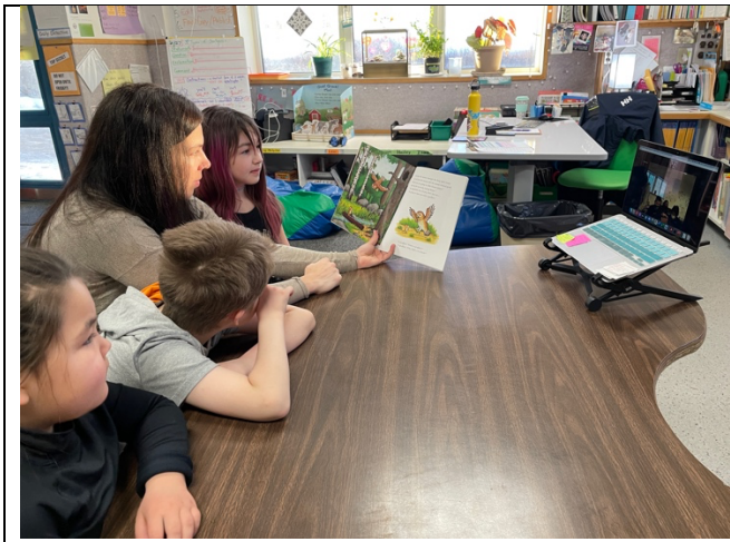
Book Buddies with Kokhanok