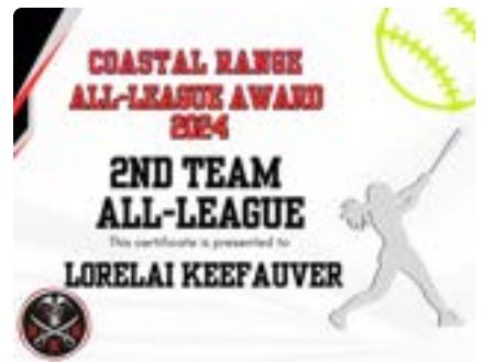
2nd Team All League