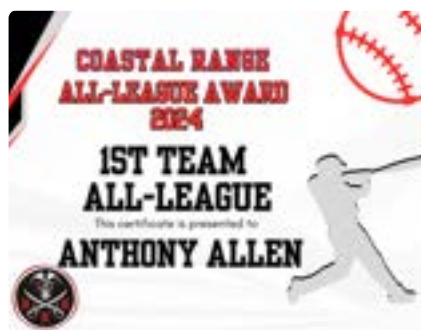
1st Team All League