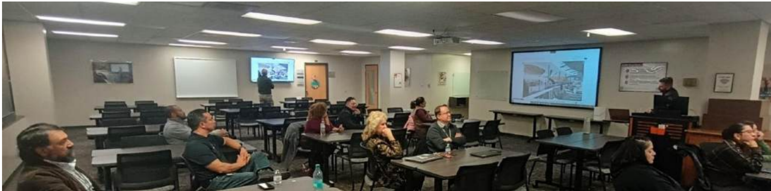
MS Color Selection Committee