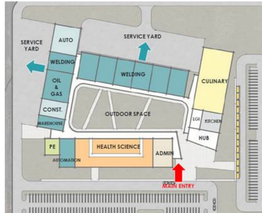
(2 nd floor)