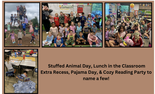
Stuffed Animal Day, Lunch in the Classroom Extra Recess, Pajama Day, & Cozy Reading Party to name a few!

These initiatives have been instrumental in creating a more supportive and engaging school culture. Our students are thriving, and I'm excited to see what they'll accomplish in the coming months.