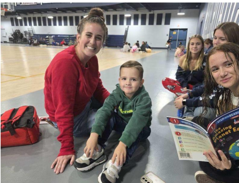
Railroaders teaming up with a good book!