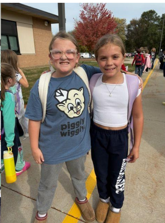
Top: A few of our Positive Office Referrals