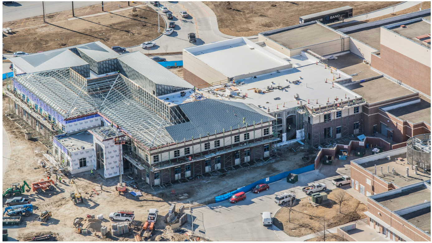
Southeast view of Area D & E masonry and rooftop