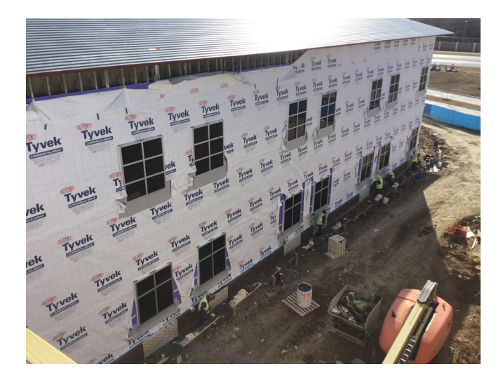
Area E - North Facade