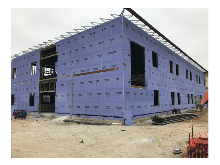
Area C - Exterior Sheathing