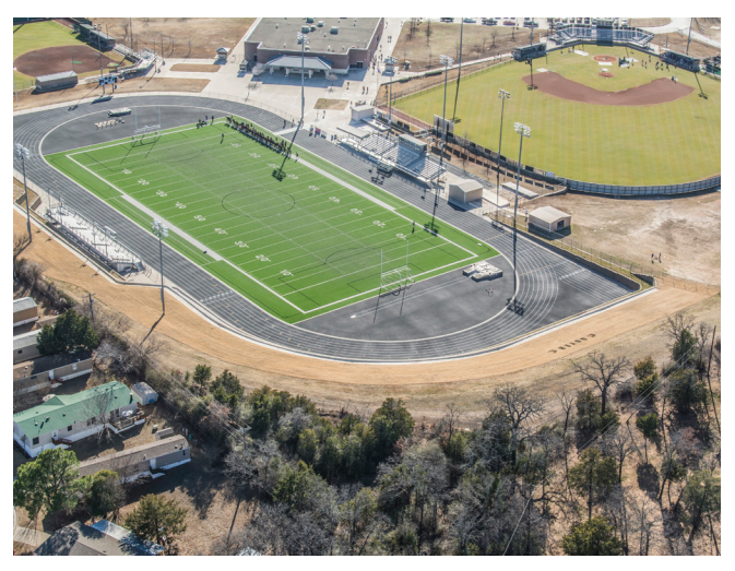
Track Striping Completed