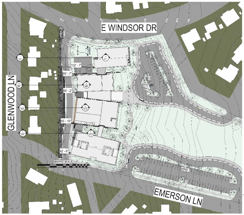
Section 6 1/8" = 1' = 20'-0"