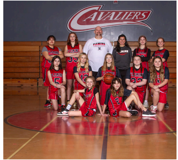
7th Grade Girls Basketball