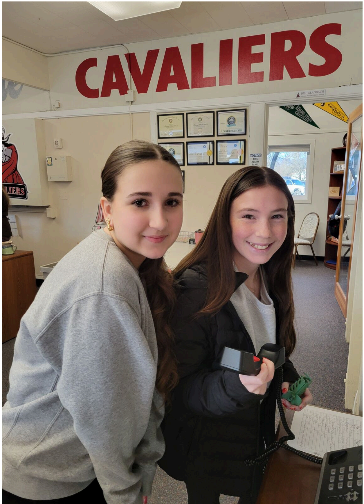
Fleming Athletics finished a great Girls Basketball and Wrestling season. Track start March 3rd.