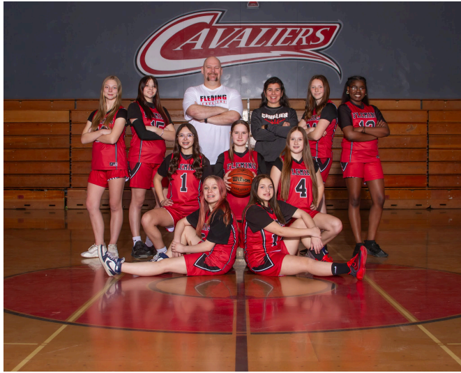
8th Grade Girls Basketball