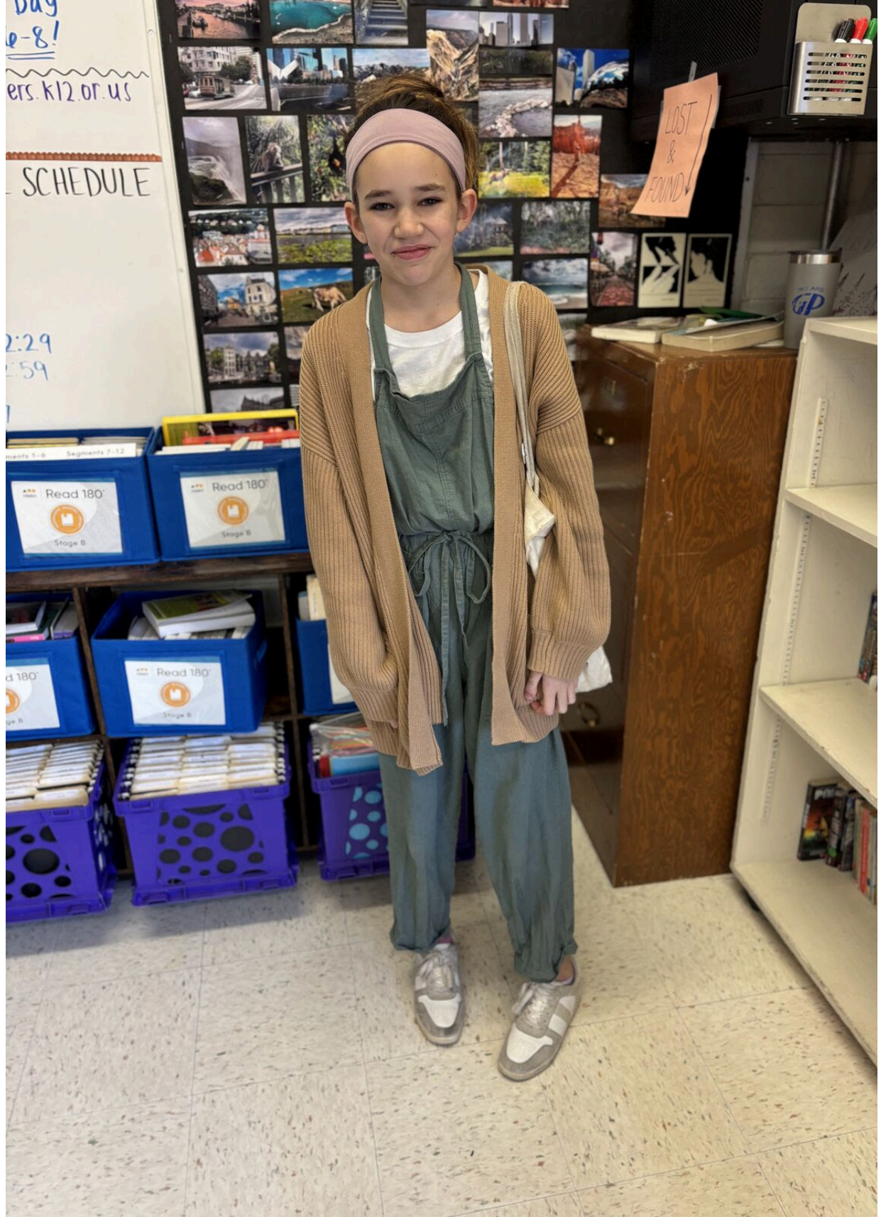
Teacher/Student Look Alike