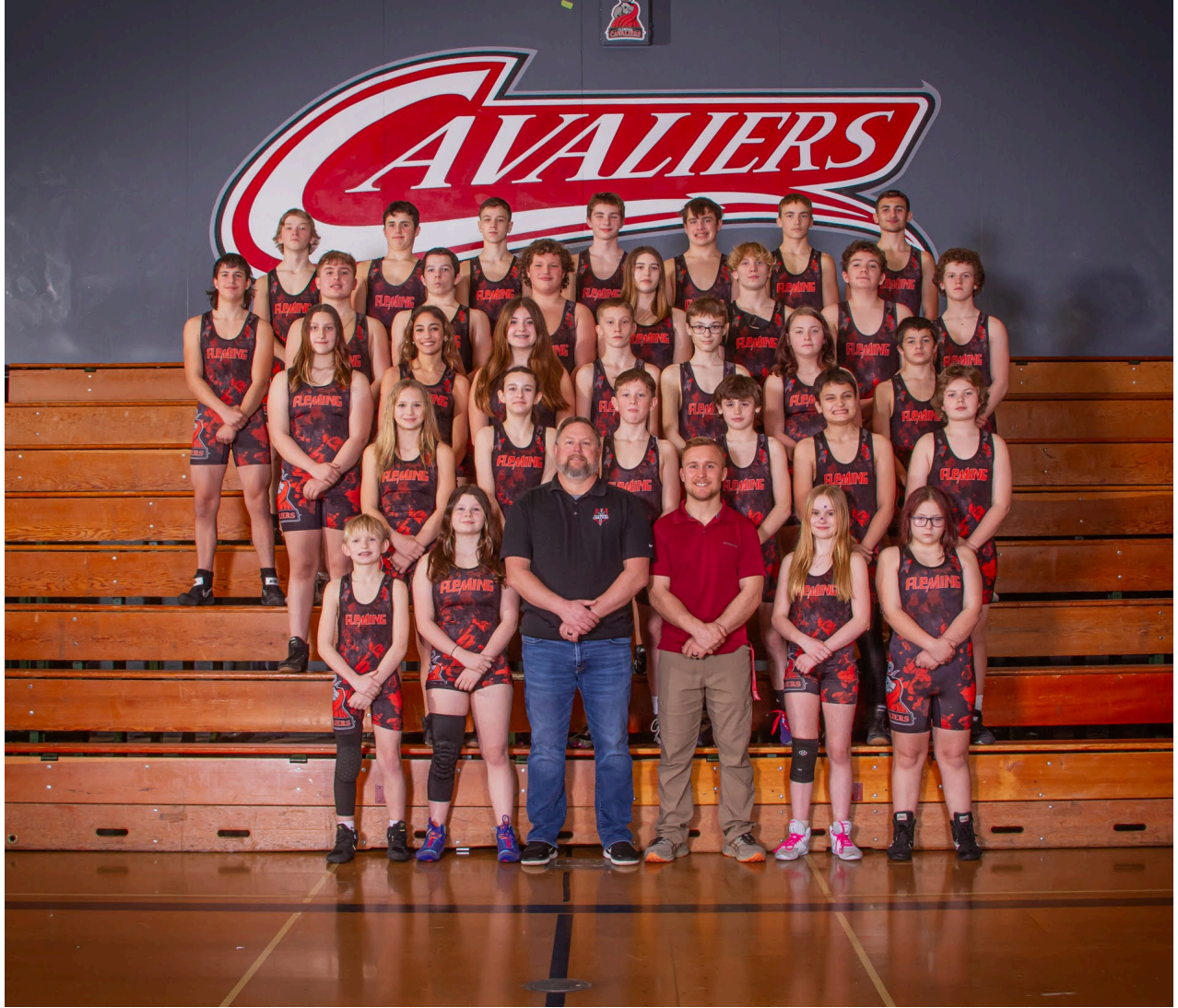
6th, 7th and 8th grade Wrestling