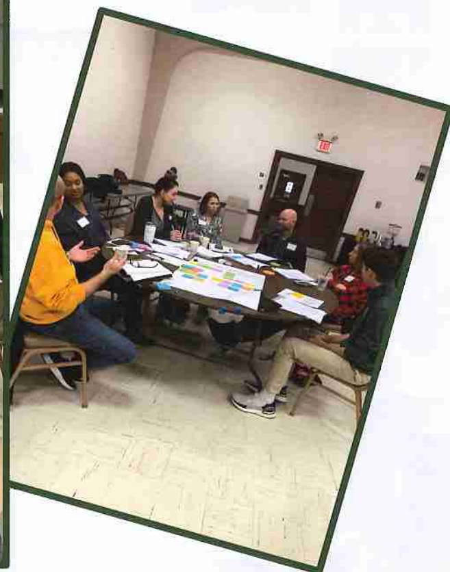
Strategic Plan Team