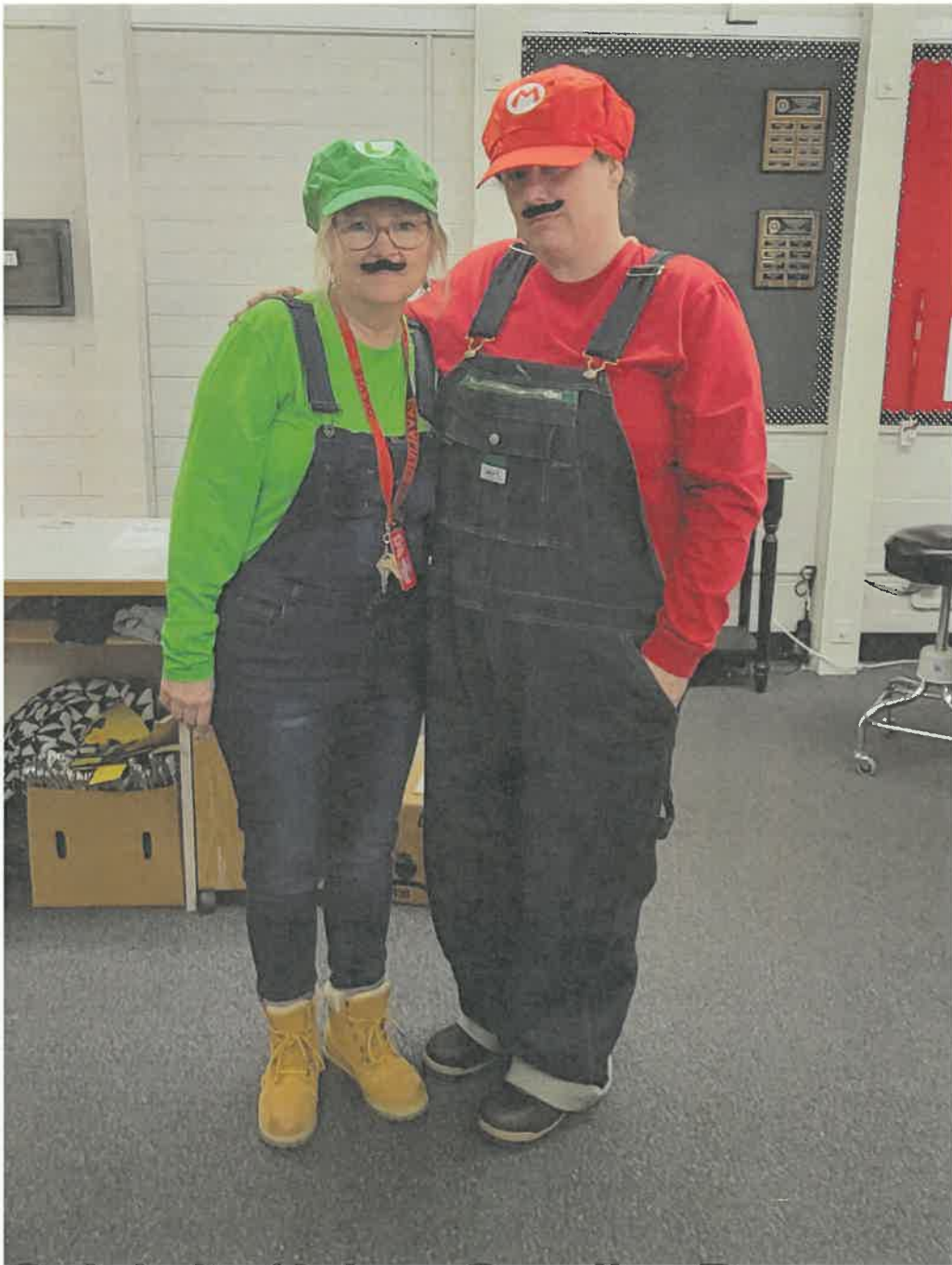
Celebrity/Adam Sandler Day