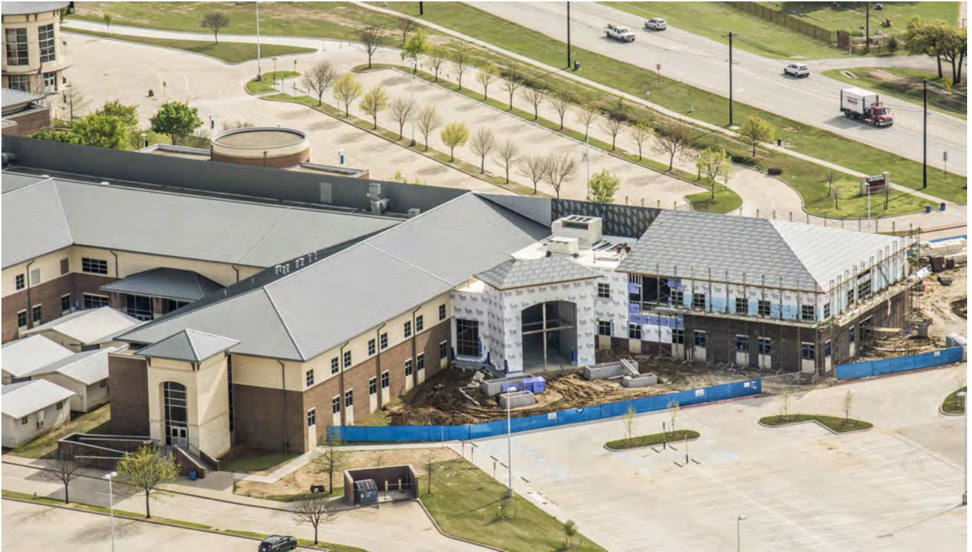
Area C - Roofing & Masonry