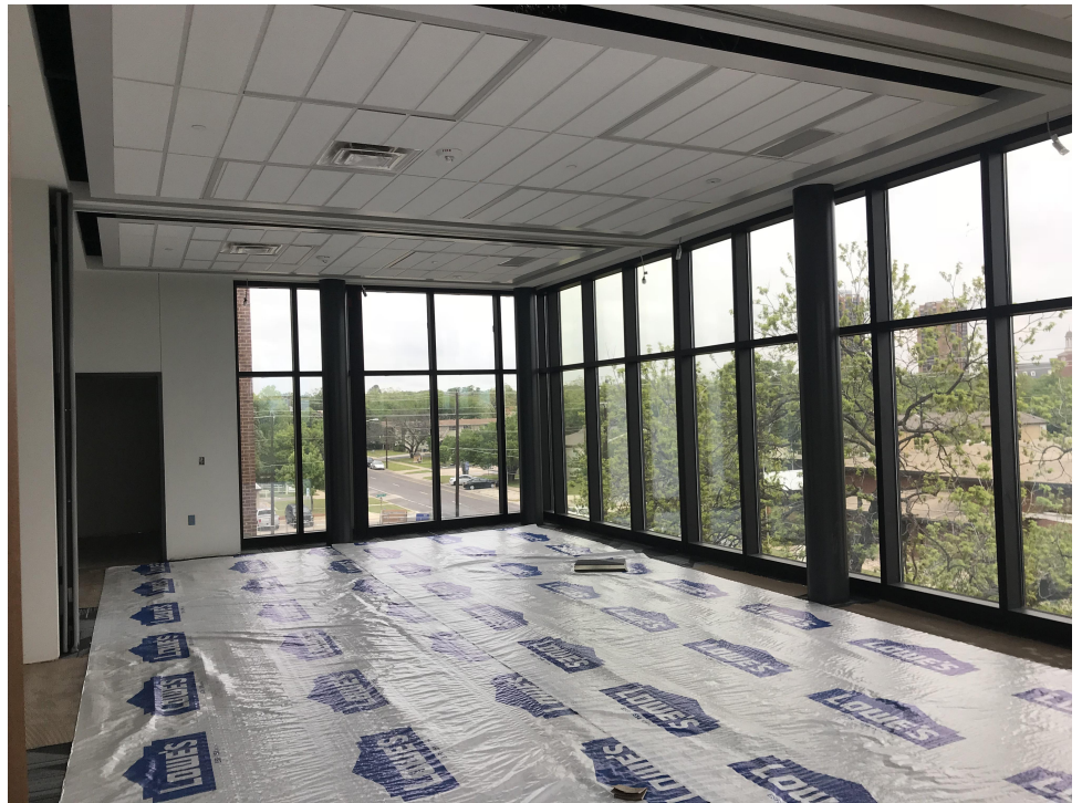
Level 3 Conference Room