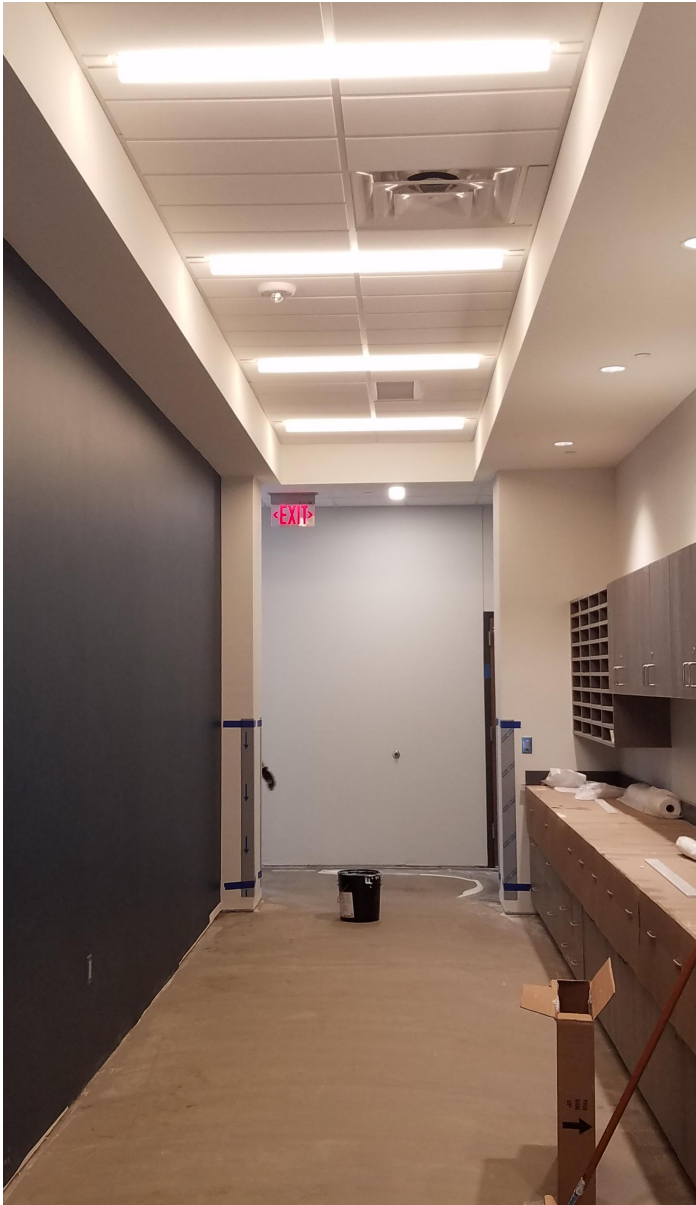
Common Work Room