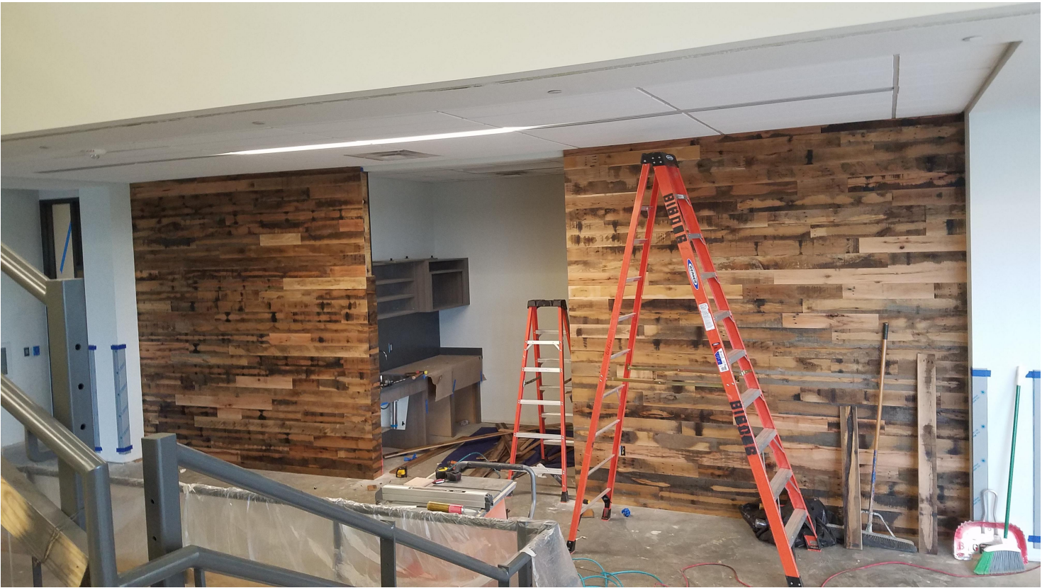
Level 2 & 3 Breakroom & Reception