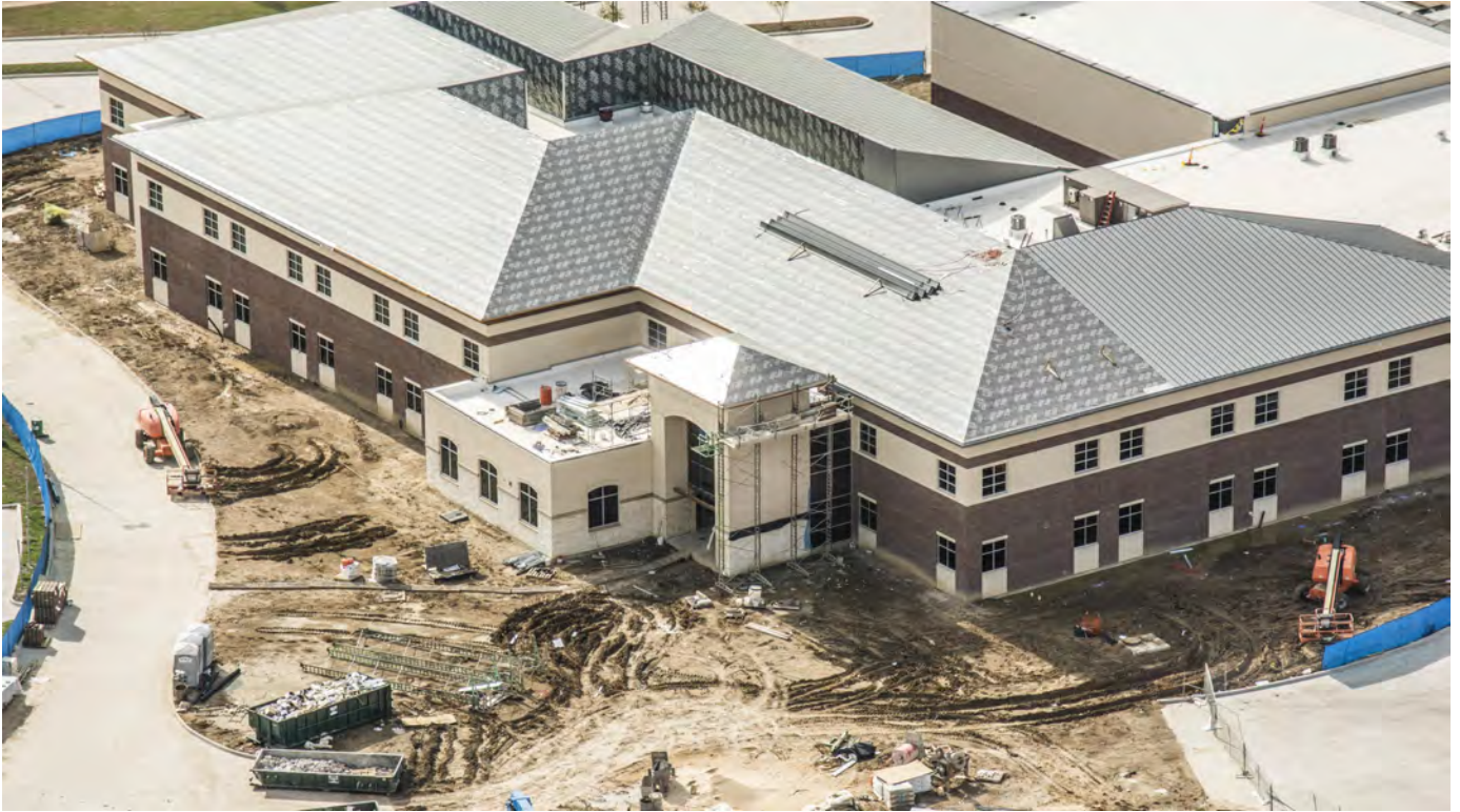
Southeast view of Area D & E masonry and rooftop