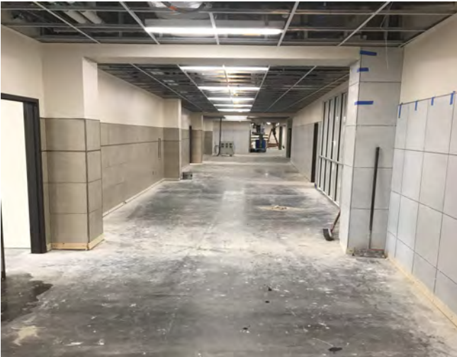
Area D & E Corridor Ceramic Tile