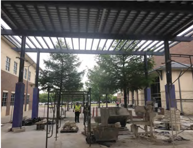
Area B - Canopy Structure