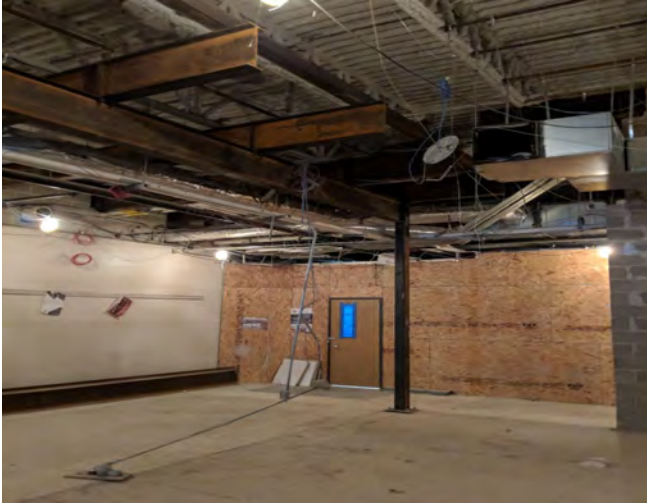
Area D - Demo & Tie-in