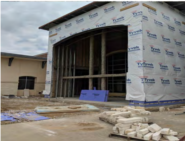
Area A - Front Entry Sheathing & Masonry Install