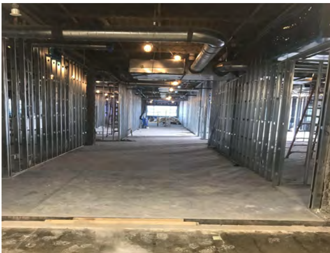
Area C - 2nd Floor Framing & Overhead Utilities