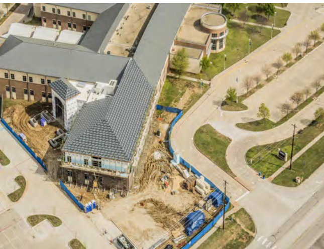
Southeast View of Area C rooftop