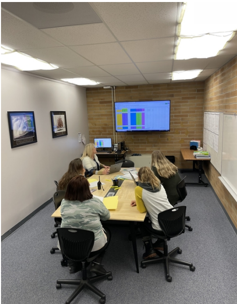
Kindergarten team working hard on analyzing data

Every minute of instruction counts, and at SBE we are maximizing our instruction through data, research based instruction, and dedication to ensuring that each student grows one full year in reading and math.