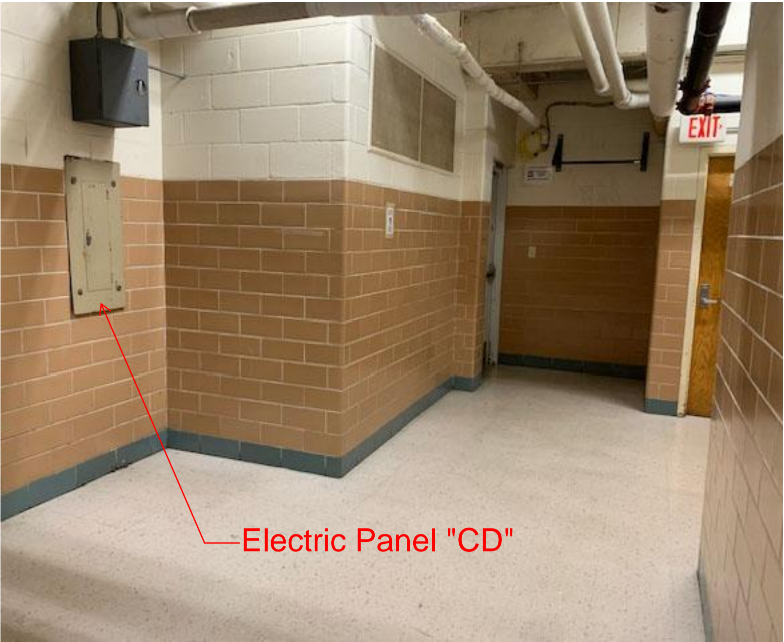
Electric Panel "CD"