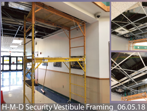
H-M-D Security Vestibule Framing_06.05.18