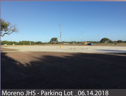
Moreno JHS - Parking Lot_06.14.2018