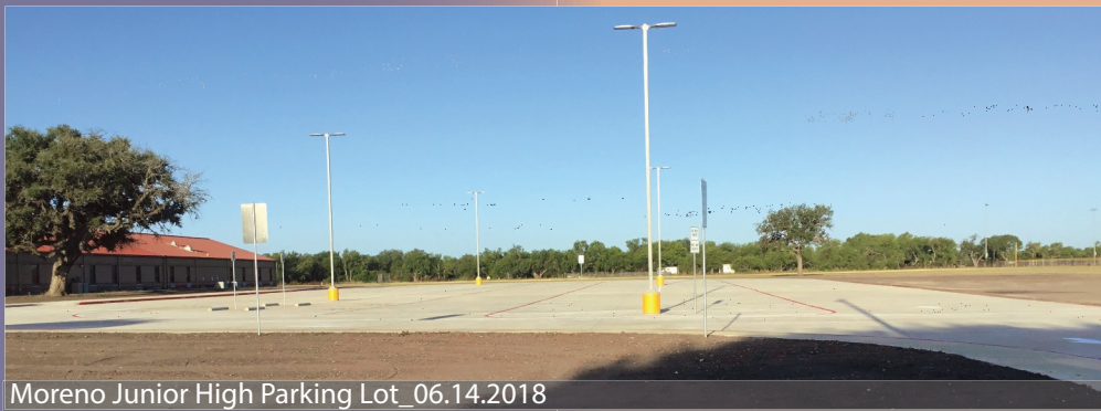
Moreno Junior High Parking Lot_06.14.2018