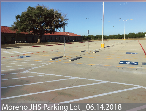
Moreno JHS Parking Lot_06.14.2018