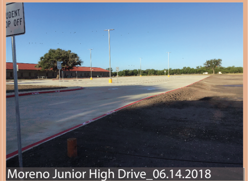
Moreno Junior High Drive_06.14.2018