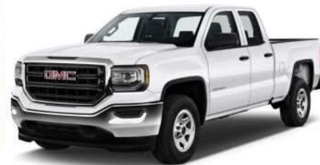
2019 GMC Sierra 1500 BASE 4x4 DBL Cab

Expected Months in Service: 24 Total Months in Service: 16 Purchase Price: $27,291 Vehicle Sale Price: $35,000 ROI: ($7,709) Net Settlement: ($12,904.90) Monthly Operating Cost ($431.80) Mileage sold at: 6,570