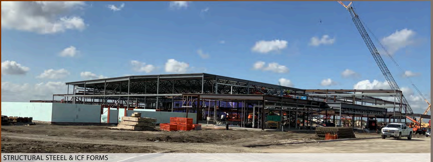
STRUCTURAL STEEL & ICF FORMS