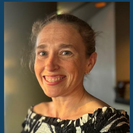
Dorothy Rhodes Communications