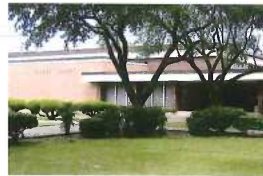
J. M. Hodges Library Wharton Campus