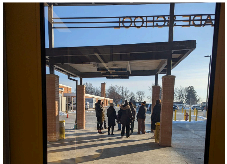
Our pick-up door crew has been phenomenal this week! We're down to 11 minutes to get everyone in cars. :) And the heat above the entrance is amazing for kids & staff!