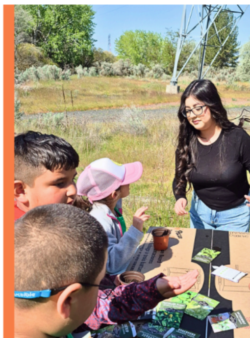
Vikings Care: Showing Heart From Classroom to Community