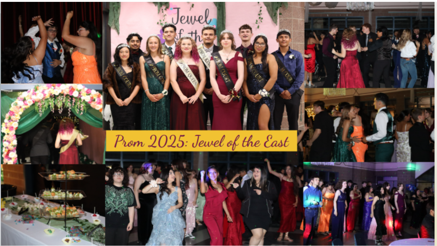
Prom 2025: Jewel of the East