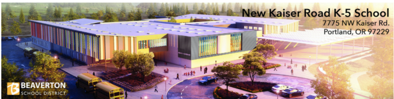
Architectural rendering of new K-5 school in the North Bethany area.