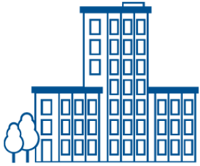
Data from LiteracyProject.org

Reading is the single most important thing parents can do to help prepare their children for school. Children who struggle to obtain access to books fall behind. Blue Bookshelf places books in the hands of young readers. You can help!