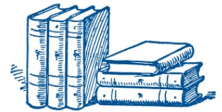
Data from Reading Psychology Journal

OF KIDS READ DAILY of those who received help from book donation programs.