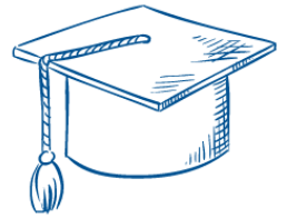
Data from LiteracyProject.org

children who are not reading by 3rd grade DO NOT GRADUATE FROM HIGH SCHOOL.