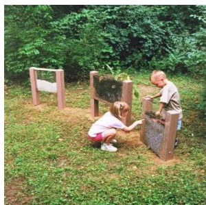
ant farm/root garden