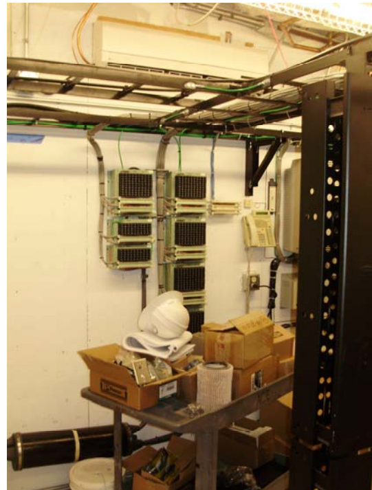
Relocated phone PBX