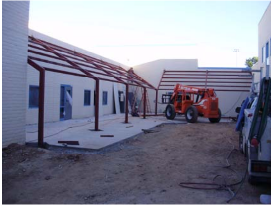
new classroom courtyard