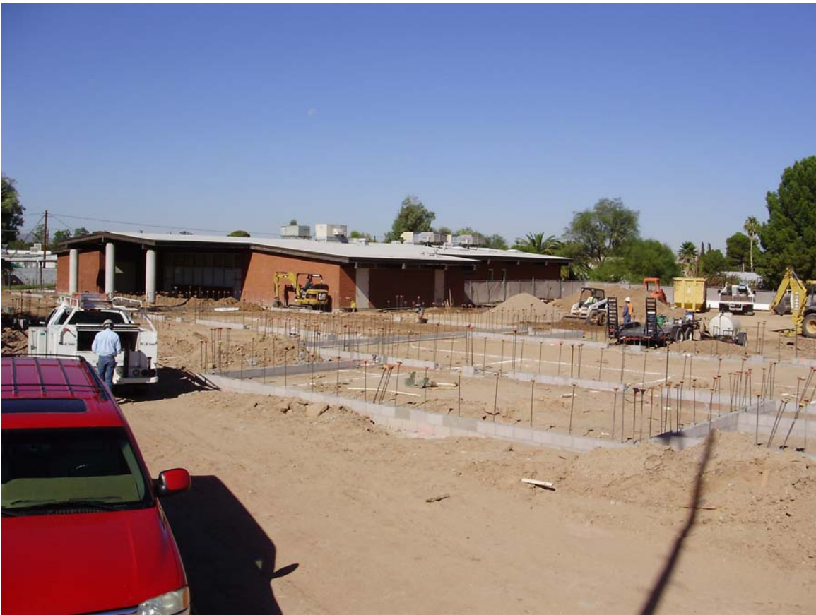
Footers, stem walls, and MPE preparation

This project is on budget and the baseline schedule is being reworked to account for the TEP mainline relocation.