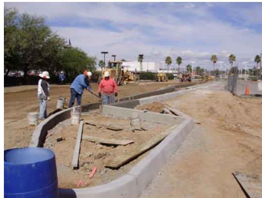
new FSS drive preparation

B. El Hogar / Land Lab : Procurement of the final phase of the security fence is under way.