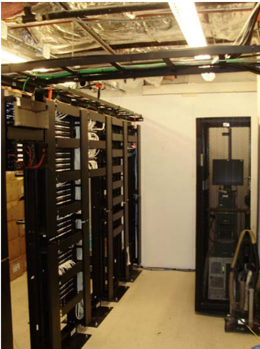
New main IT server