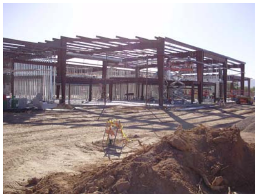
Steel frame erection, interior framing, and MPE preparation