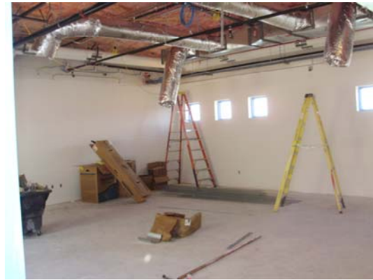
new classroom MPE and drywall