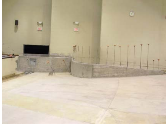
New wheelchair ramp to stage

E. Nash Elementary Classroom Addition: Programming of the classroom addition at Nash Elementary is continuing. Design development drawings are complete.