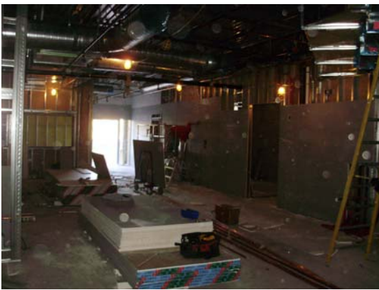
new kitchen MPE and drywall