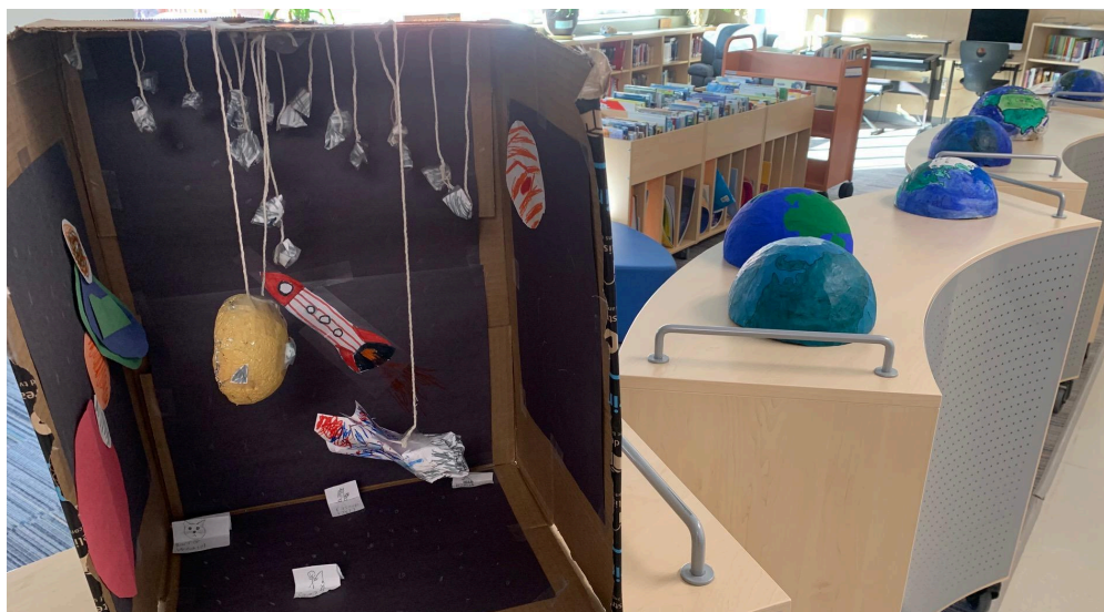
HS Earth Science created Northern Hemispheres