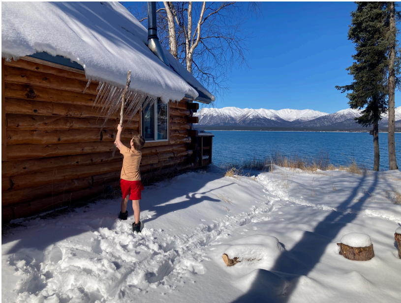
Gotta clean those icicle off!

Tanalian students around town after school hours.