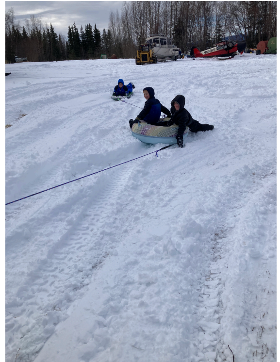
Kids towing on the rare snow day 8" in March