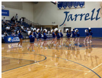
Cheer Half-time Performance