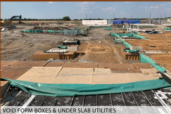
VOID FORM BOXES & UNDER SLAB UTILITIES