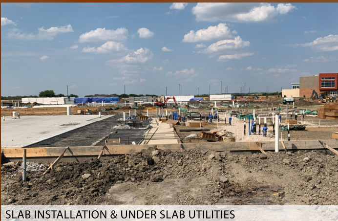
SLAB INSTALLATION & UNDER SLAB UTILITIES