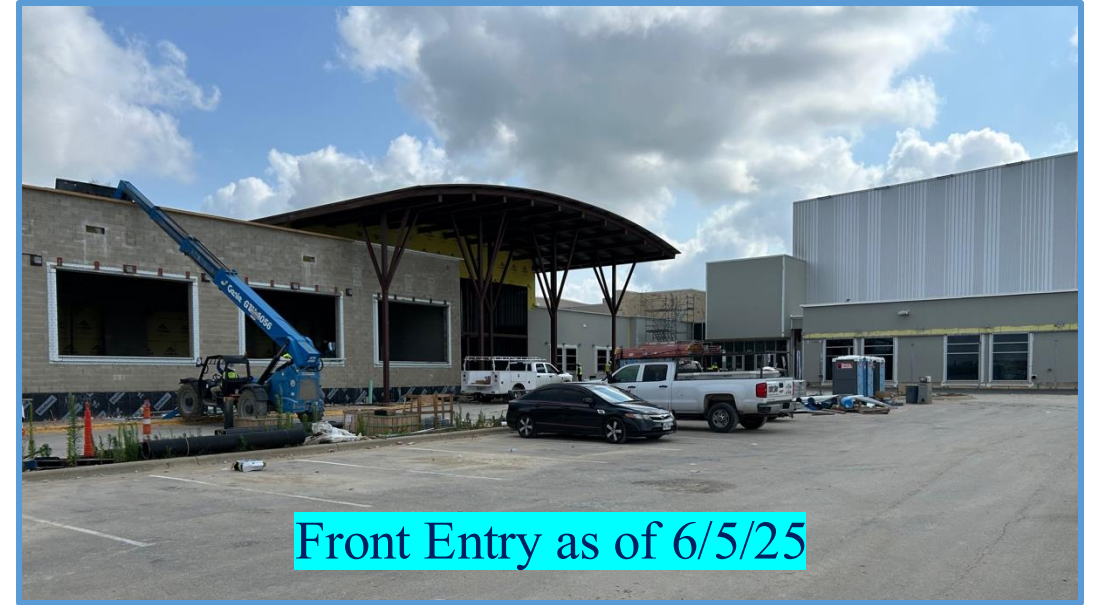
Front Entry as of 6/5/25