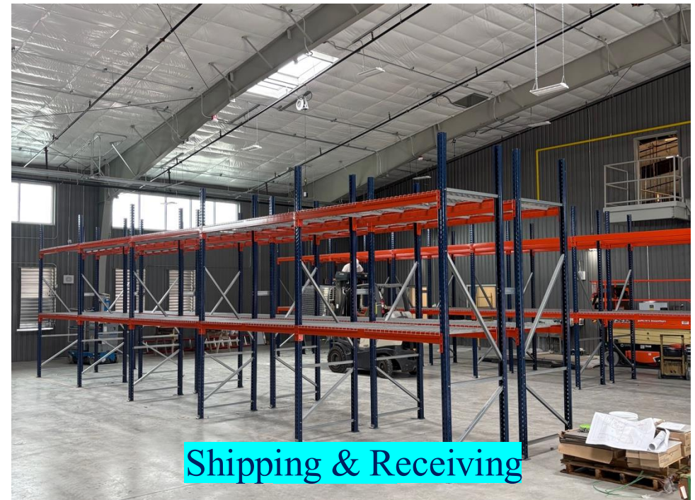
Shipping & Receiving