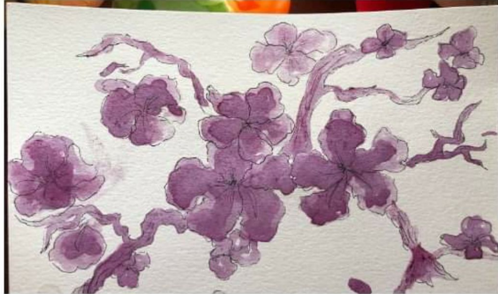
I made this with smashed blackberries and a little water!