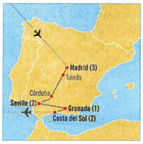
* Map may not reflect your final trin minerary

JUN 15, 2015: MADRID Madrid's rich heritage comes alive on your guided city sightseeing tour. View classic boulevards and fountains, discover the Plaza Mayor and see the statue of Don Quixote in the Plaza de España. Marvel at the Palacio Real and delight in the lively Puerta del Sol, the point from which all distances in Spain are measured. You will also feast on world-acclaimed art at the Prado, including works by El Greco, Velázquez, and Goya. This afternoon you may choose to step back to Spain's golden age on an optional excursion to El Escorial before reflecting on somber memories at the Valley of the Fallen. (B,D)