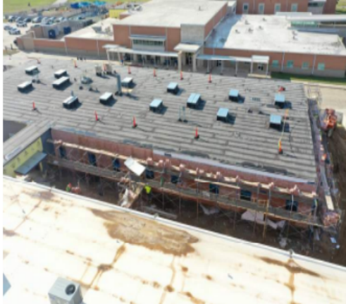
Primary School Additions