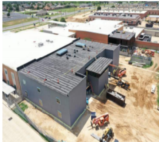
Intermediate School Additions