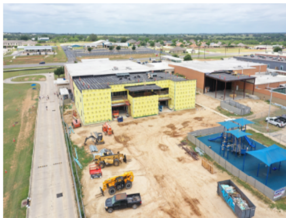
Intermediate School Additions