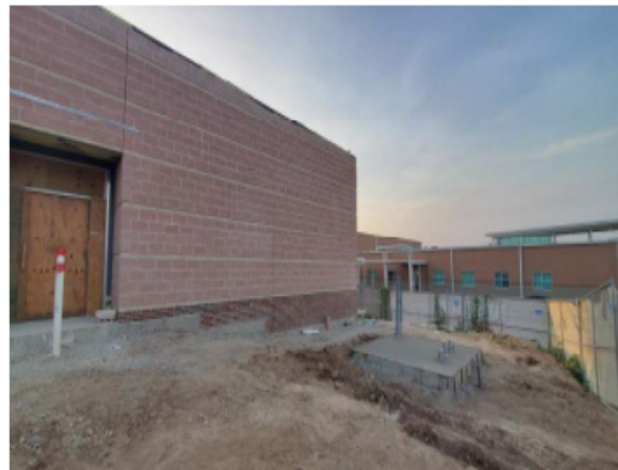
Primary School Additions