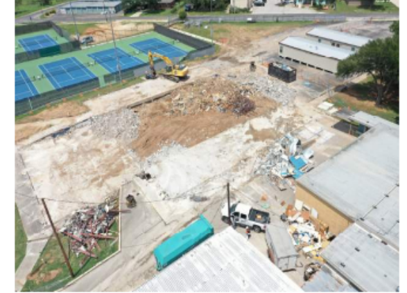
PKG 2 Additions