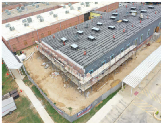
Primary School Additions