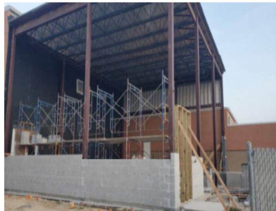
Intermediate School Additions