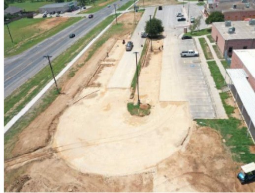
Primary School Additions