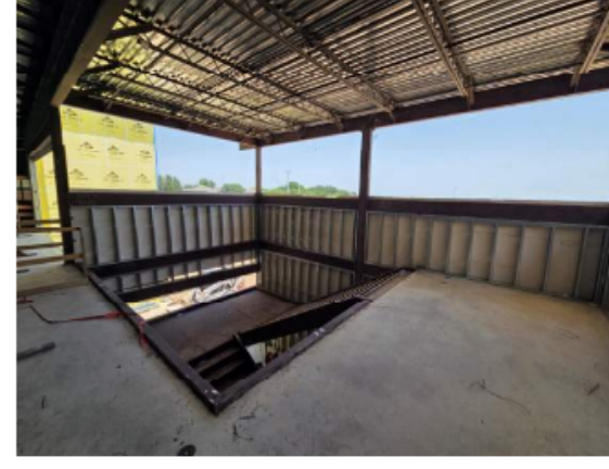
Intermediate School Additions