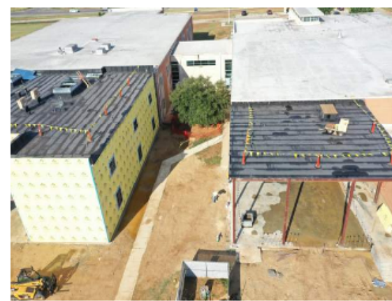
Intermediate School Additions