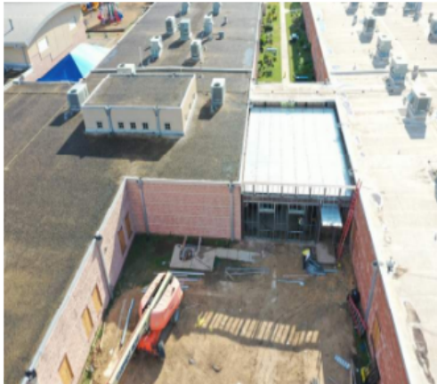
Primary School Additions