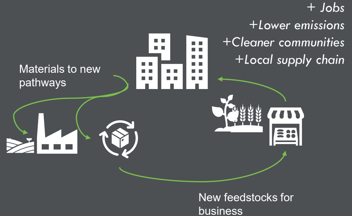
Value Building Communities