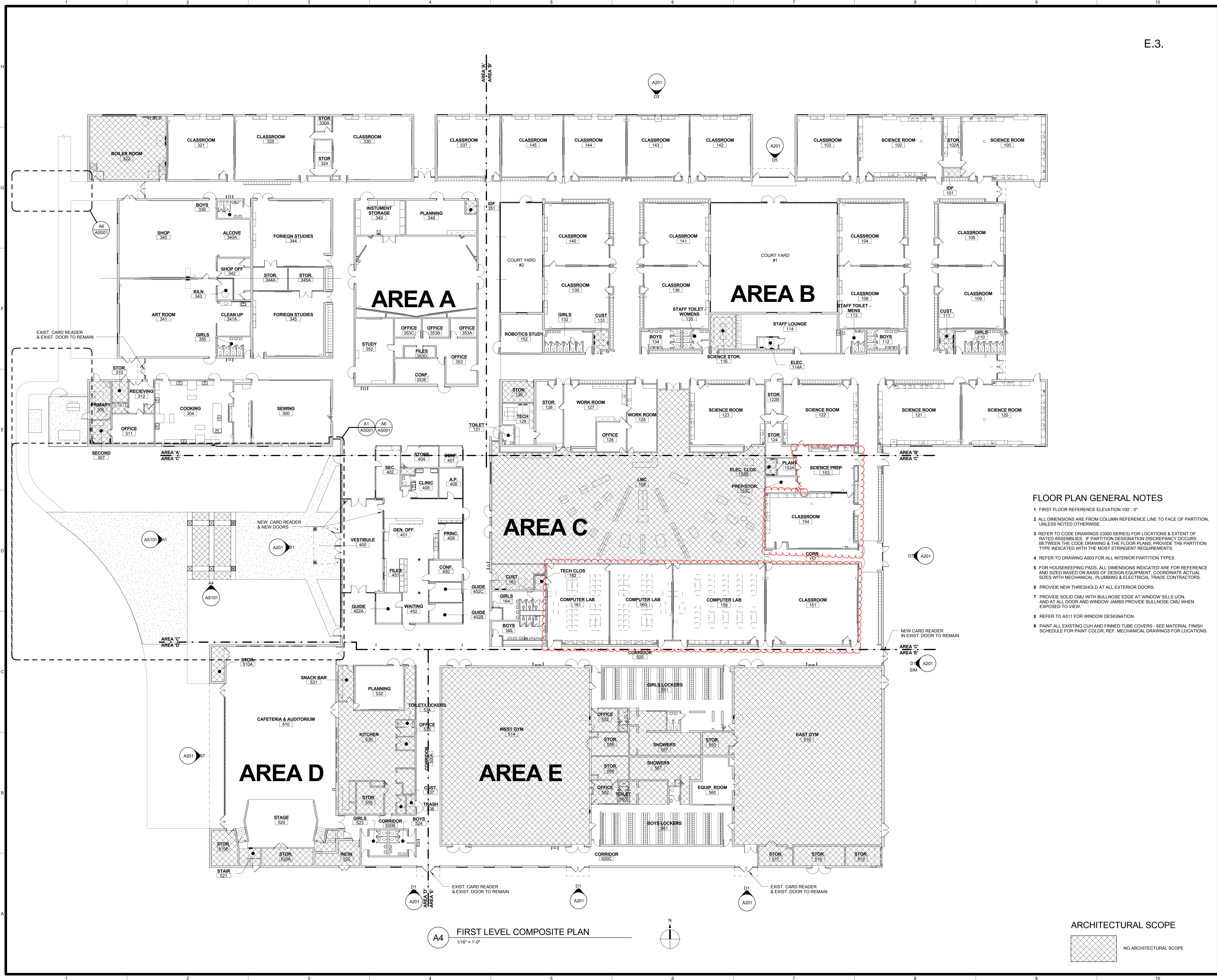
A4 FIRST LEVEL COMPOSITE PLAN 1/16" = 1'-0"