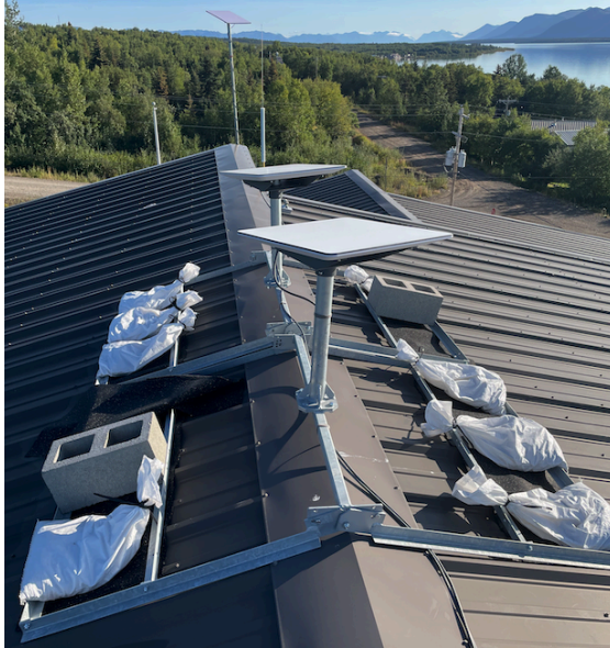
Microcom Starlink Terminal Pair

The Microcom service has consistently met or exceeded our expectations at all eight schools. Their solution has proven to be fast and reliable. While the quality of installation at a few locations did not meet our expectations, I am working with Microcom to rectify these issues and they have no immediate effect on performance.