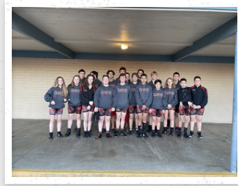
FLEMING WRESTLING TEAM