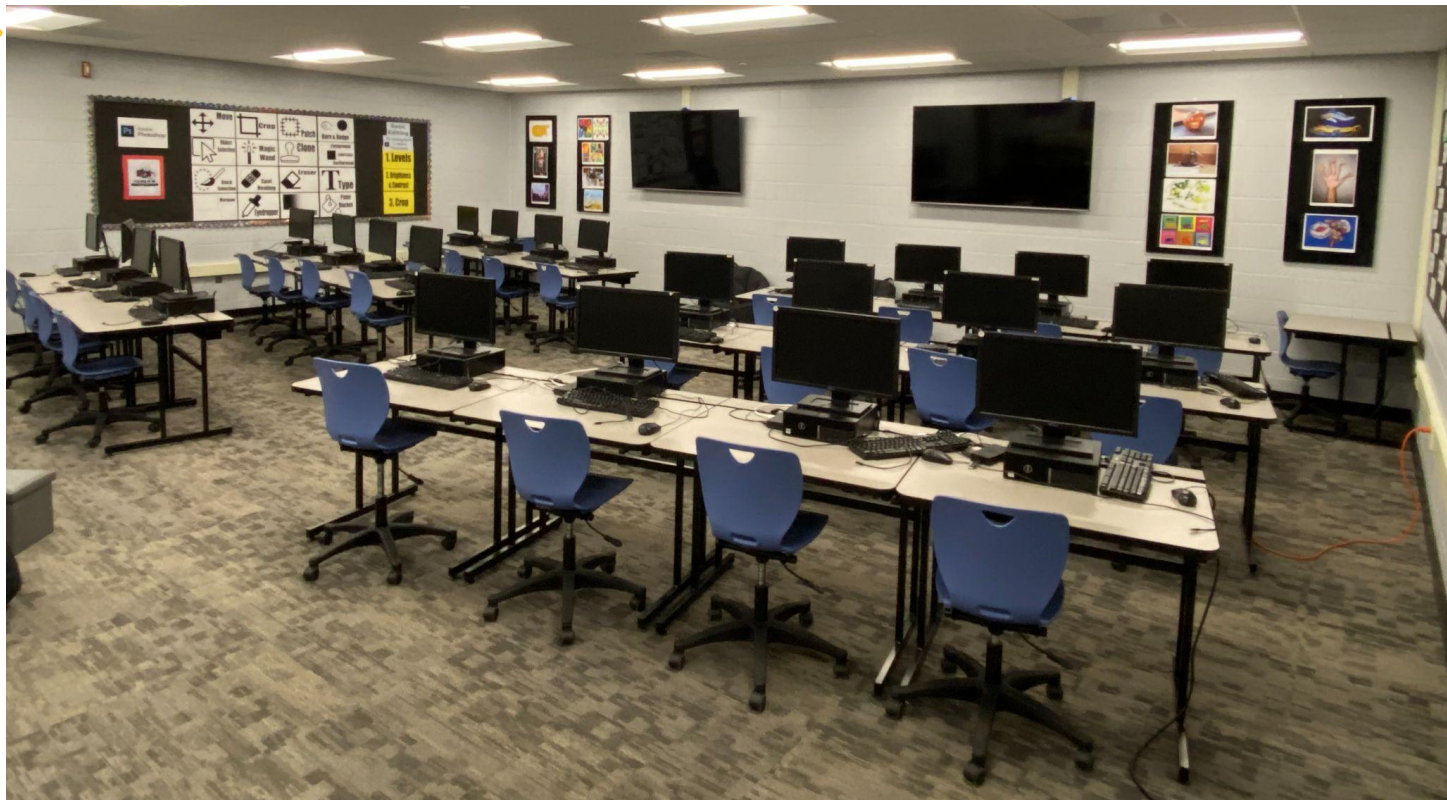
Computer Art Lab