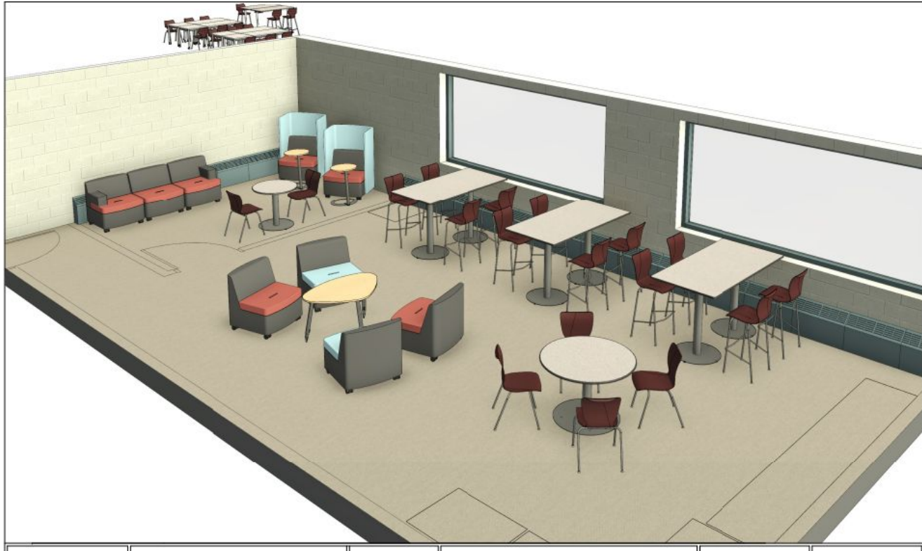
Teacher Lunch Room