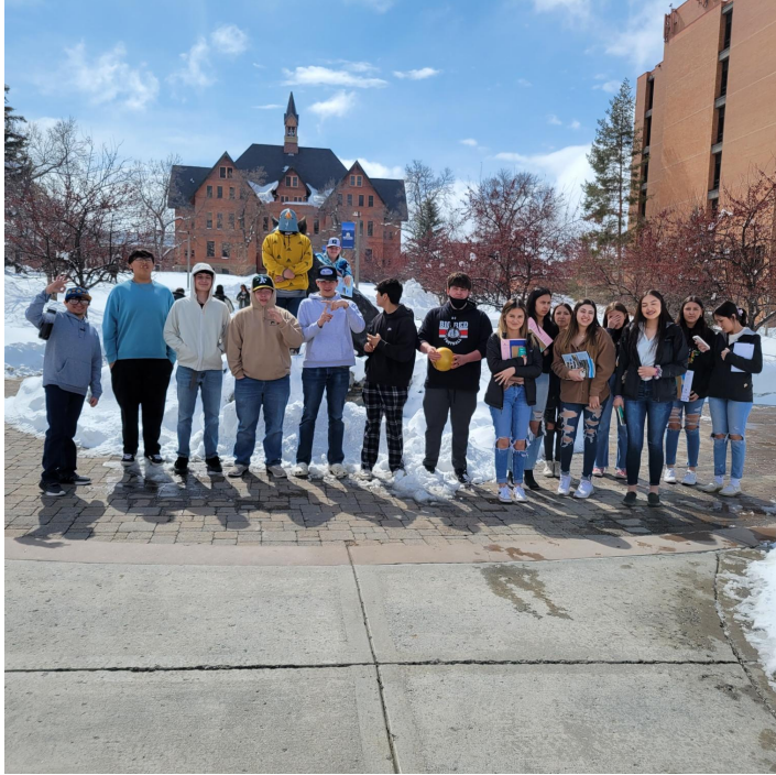
11th grade MSU Campus Visit