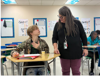
7th Grade Math Skittles Lab.