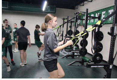
8th grade Girls Athletics use our new weight room for strength & conditioning.