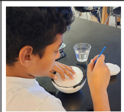
Students in 6th grade science classes created the layers of the Earth.